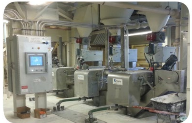
Davis WTP, Austin TX