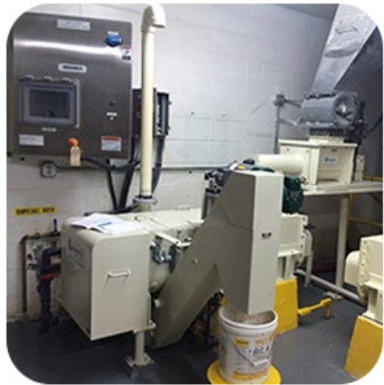
Nebraska City WWTP, NE