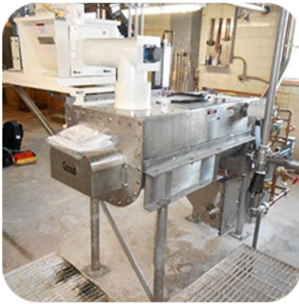
Campbell's Soup Manufacturing Plant, Napoleon OH