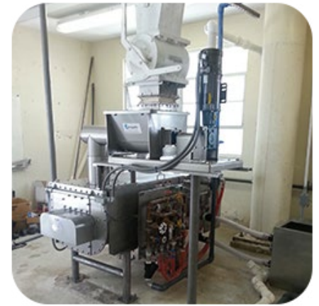
Fort Pierce Utilities Authority, FL