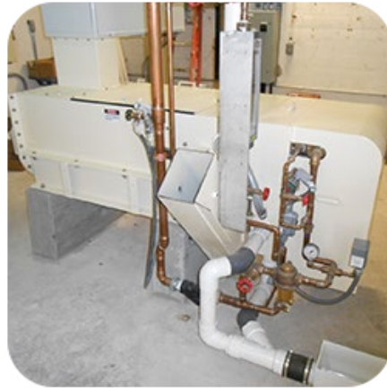
Public Water Supply District #2, Defiance MO