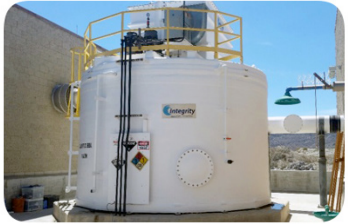
San Jacinto Valley