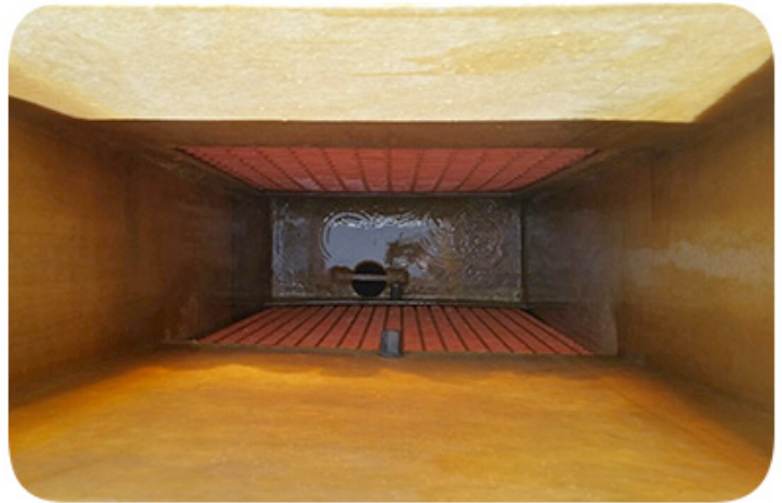
Temecula Valley Scrubber Interior Before/After Acid Wash