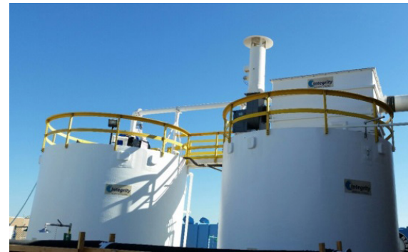
Perris Valley, EMWD

Exterior PVC drain/overflow and sight-glass piping was replaced on all four systems. FRP recirculation discharge piping was replaced as needed. Miscel-